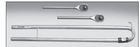
Extended Handle Ratchets